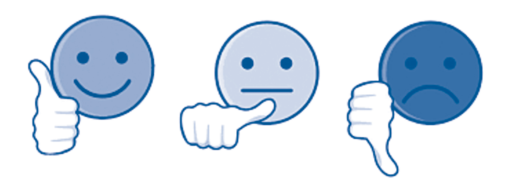
Activity - Exercise on Dealing with a Complaint – 10 minutes

Pair participants and present each with one of the following scenarios ( Trainers to develop relevant local examples). After five minutes ask them to swap partners. You are in-charge of the visiting box. A visitor is complaining that they did not get a full time allocated on their visit;